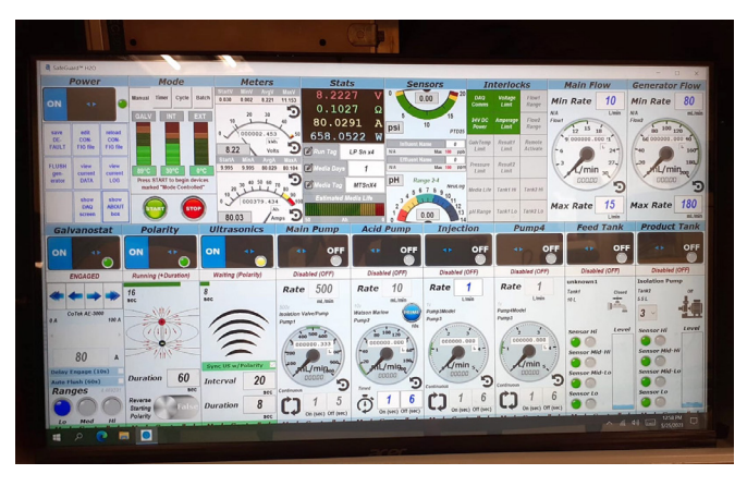
SafeGuard<sup>™</sup> H2O Arsenic Removal System Control Panel

The SafeGuard<sup>™</sup> H2O technology uses a non-toxic, certified reagent precursor material (low carbon steel) and an in-situ electrolytic generator to create a ferrous reagent onsite and on-demand. SafeGuard<sup>™</sup> H2O features automatic dosing and incorporates proprietary continuous, real-time monitoring of contaminant levels at the influent and effluent to ensure optimal treatment and compliance with regulatory and operational targets 24/7/365. As with any water treatment system, high frequency continuous water quality monitoring of contaminants such as arsenic and iron at critical treatment process steps supports process automation, optimization, reliability, and can give remote visibility of system performance for the utility and their customers.